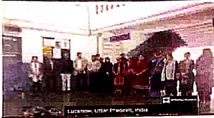
Group photograph, with participants and the Resource person of the sessions